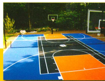
1/2 Basketball Court